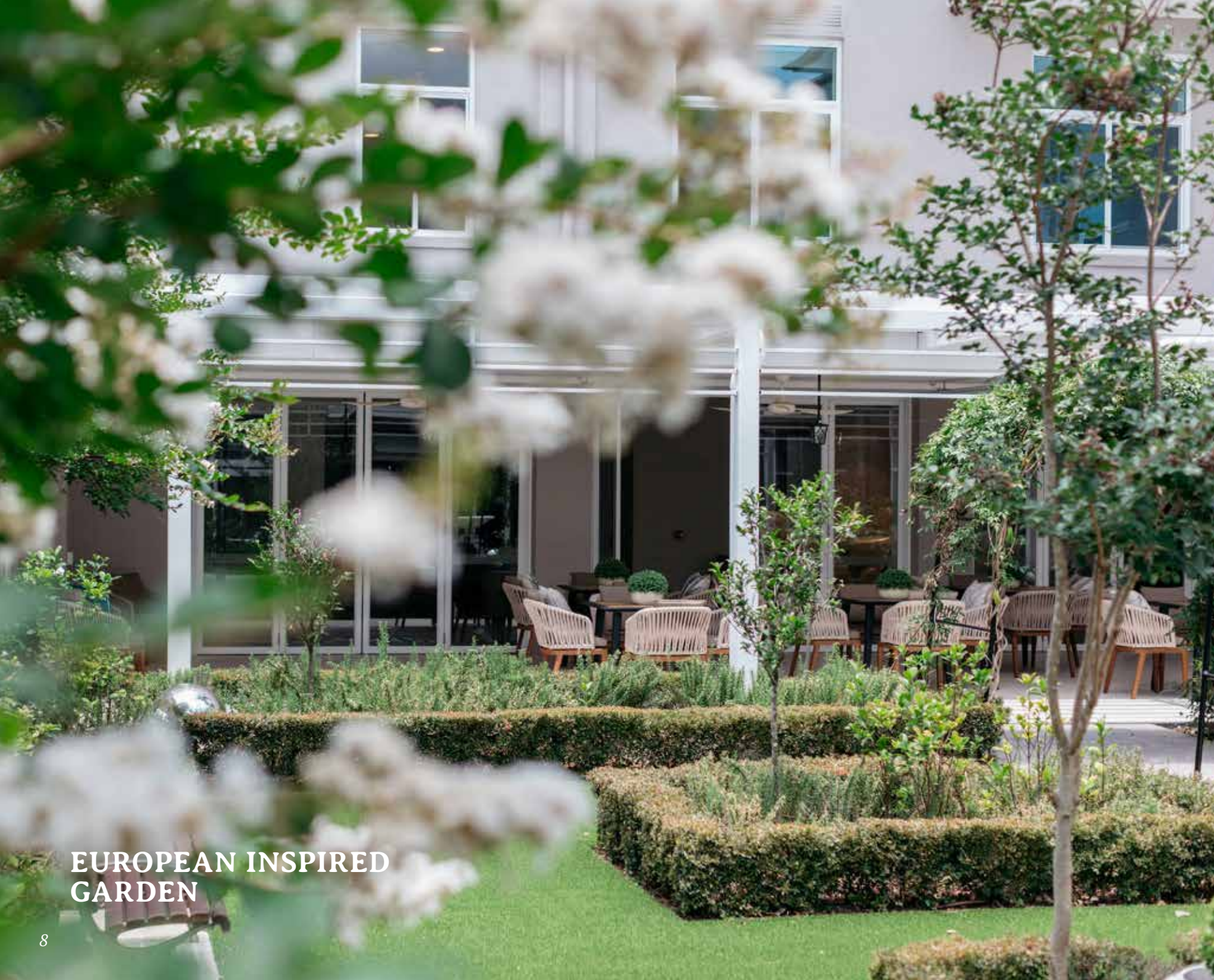
EUROPEAN INSPIRED GARDEN