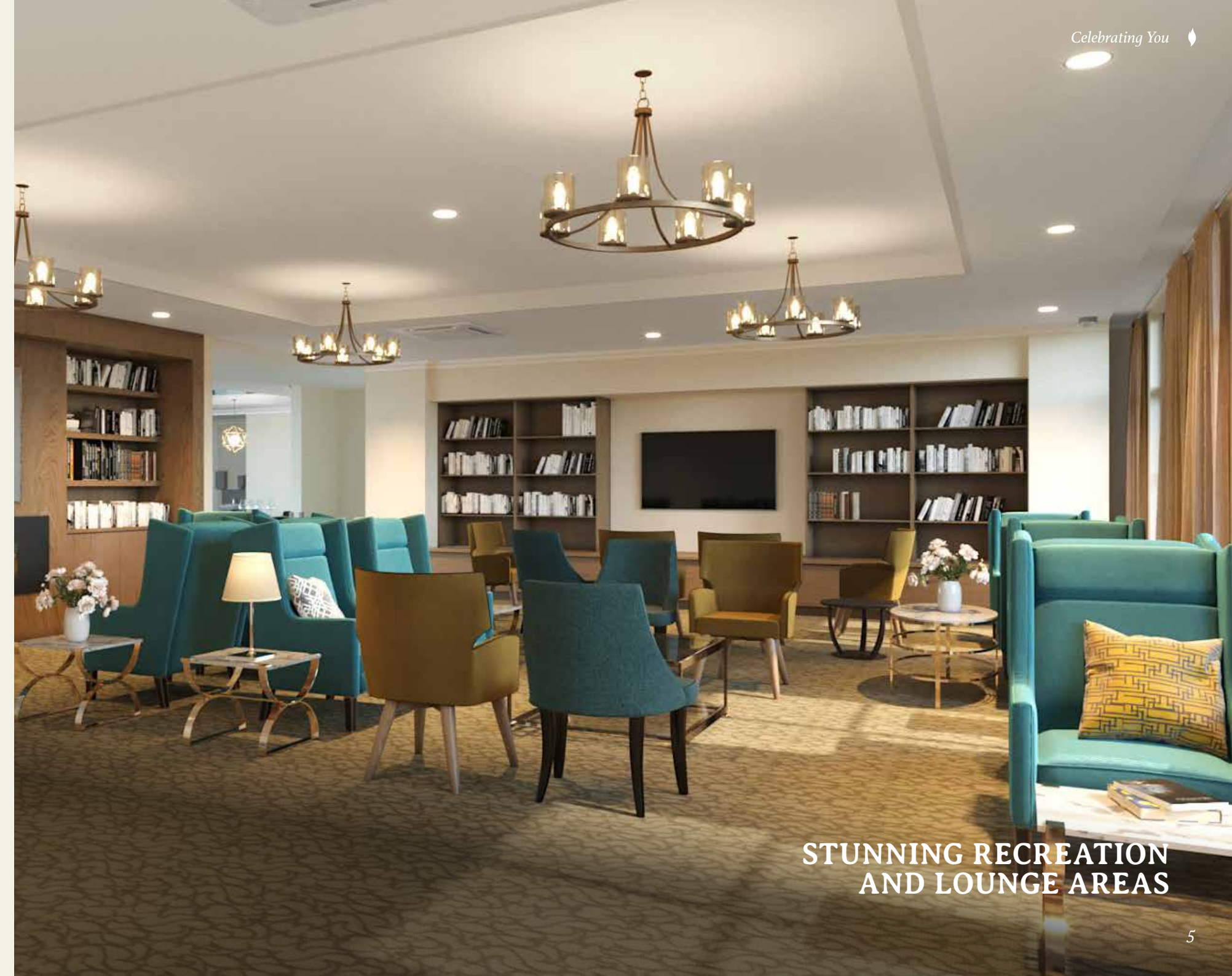
STUNNING RECREATION AND LOUNGE AREAS