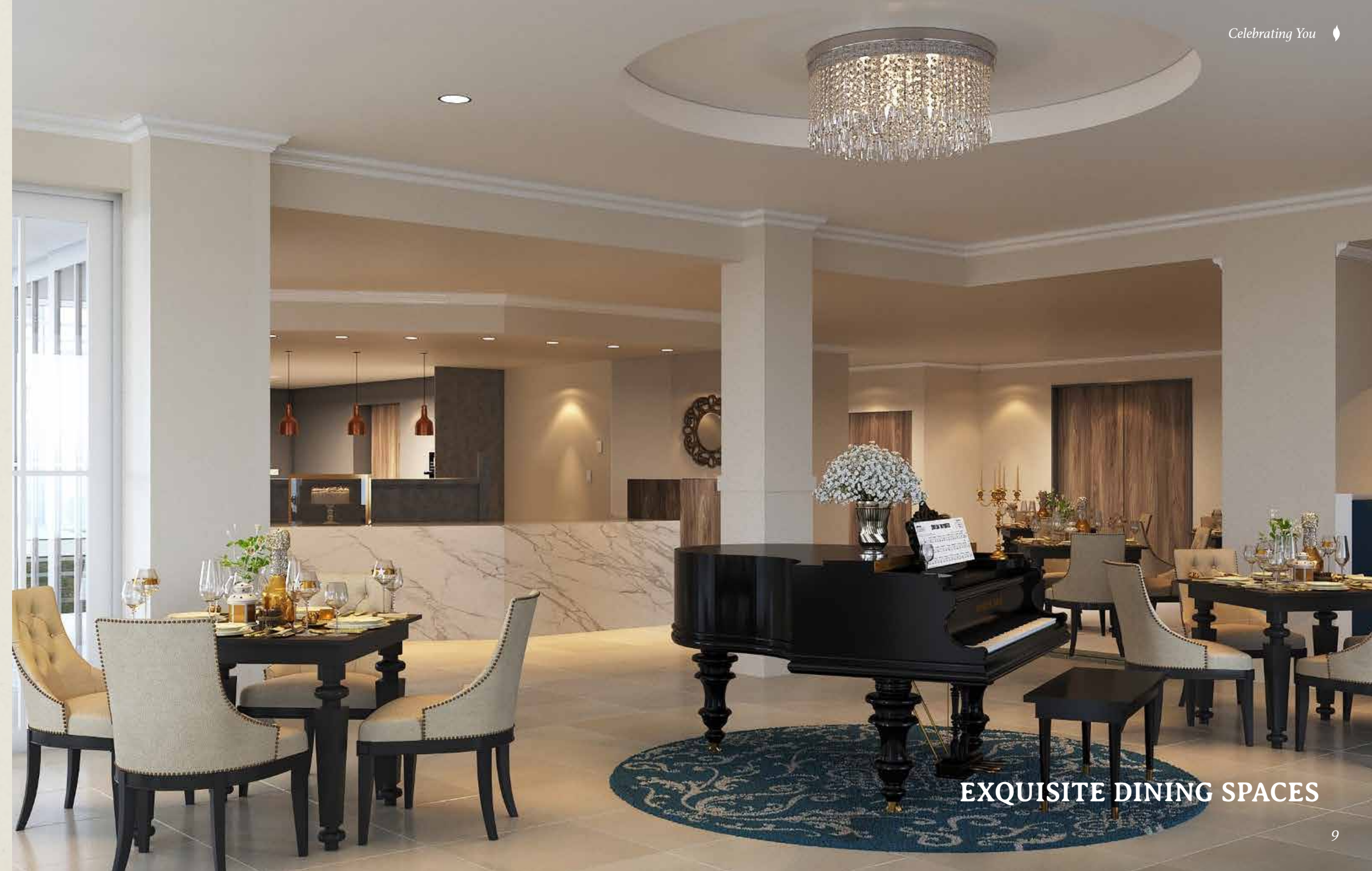
EXQUISITE DINING SPACES