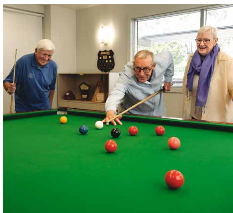
Gathering around the snooker table for a drink any afternoon of the week