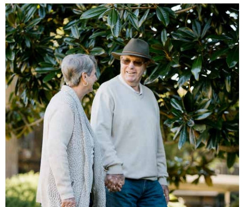
Going on bushwalks through the Royal National Park located next to the village.