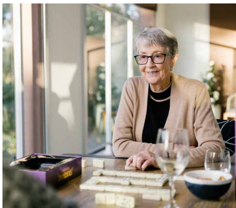
Taking some time out for themselves to enjoy the village's library and games room